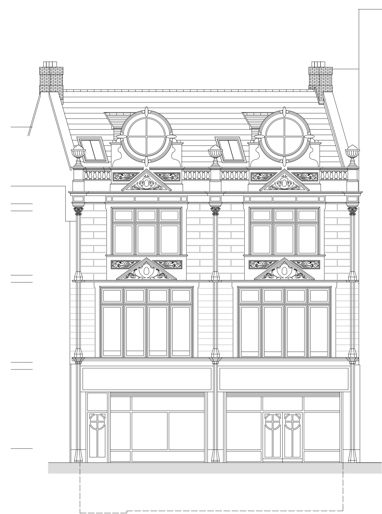
south west elevation