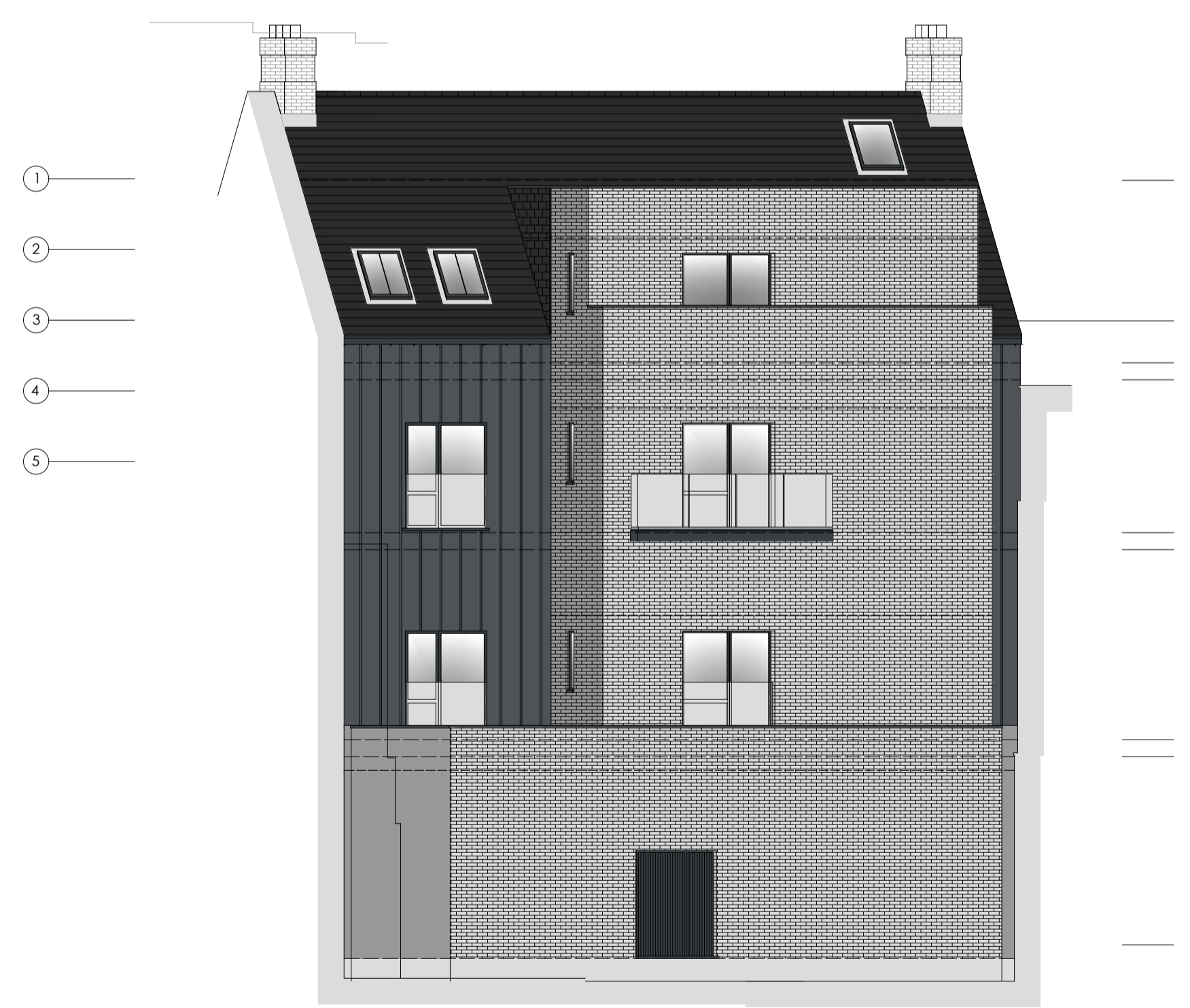
north east elevation