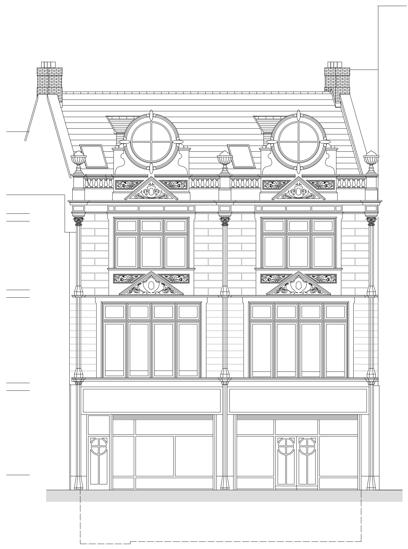
south west elevation