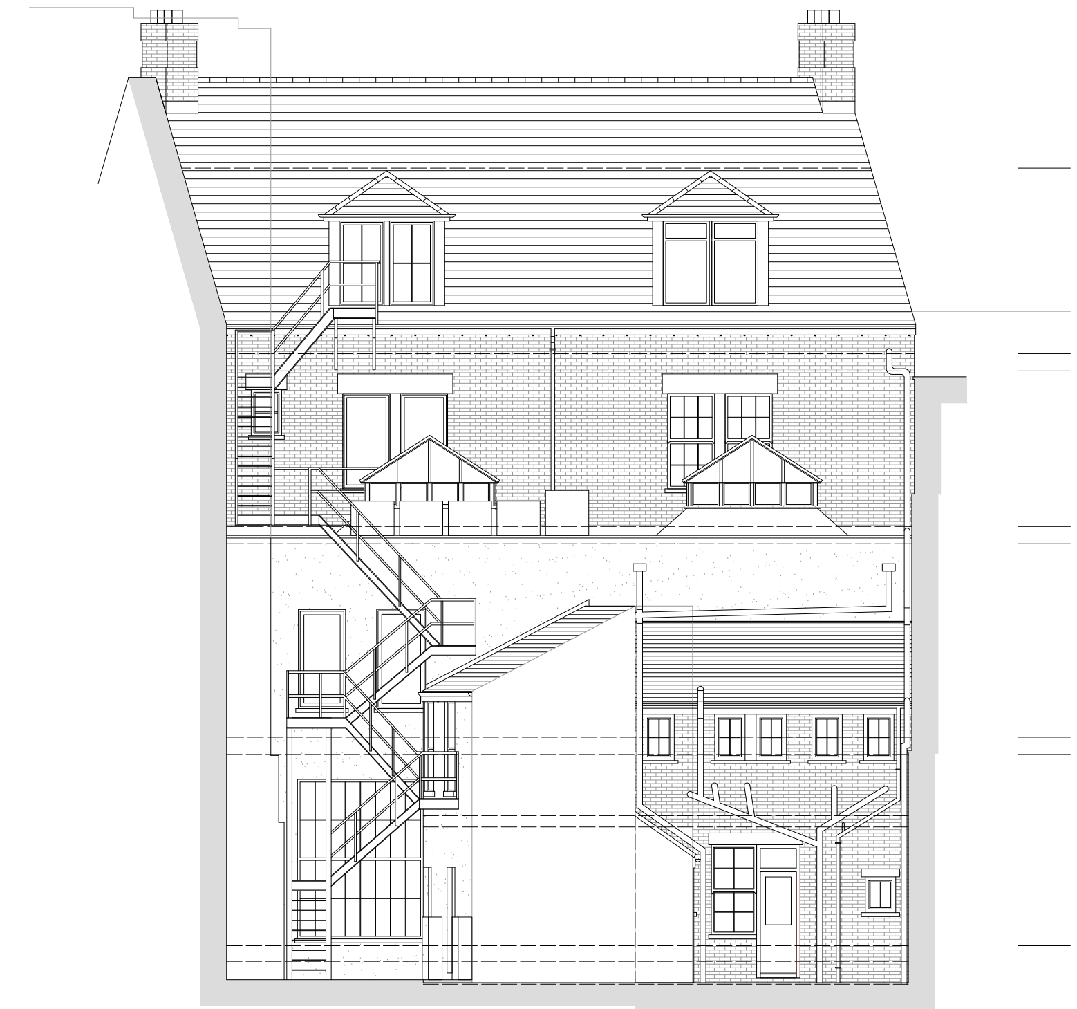
north east elevation