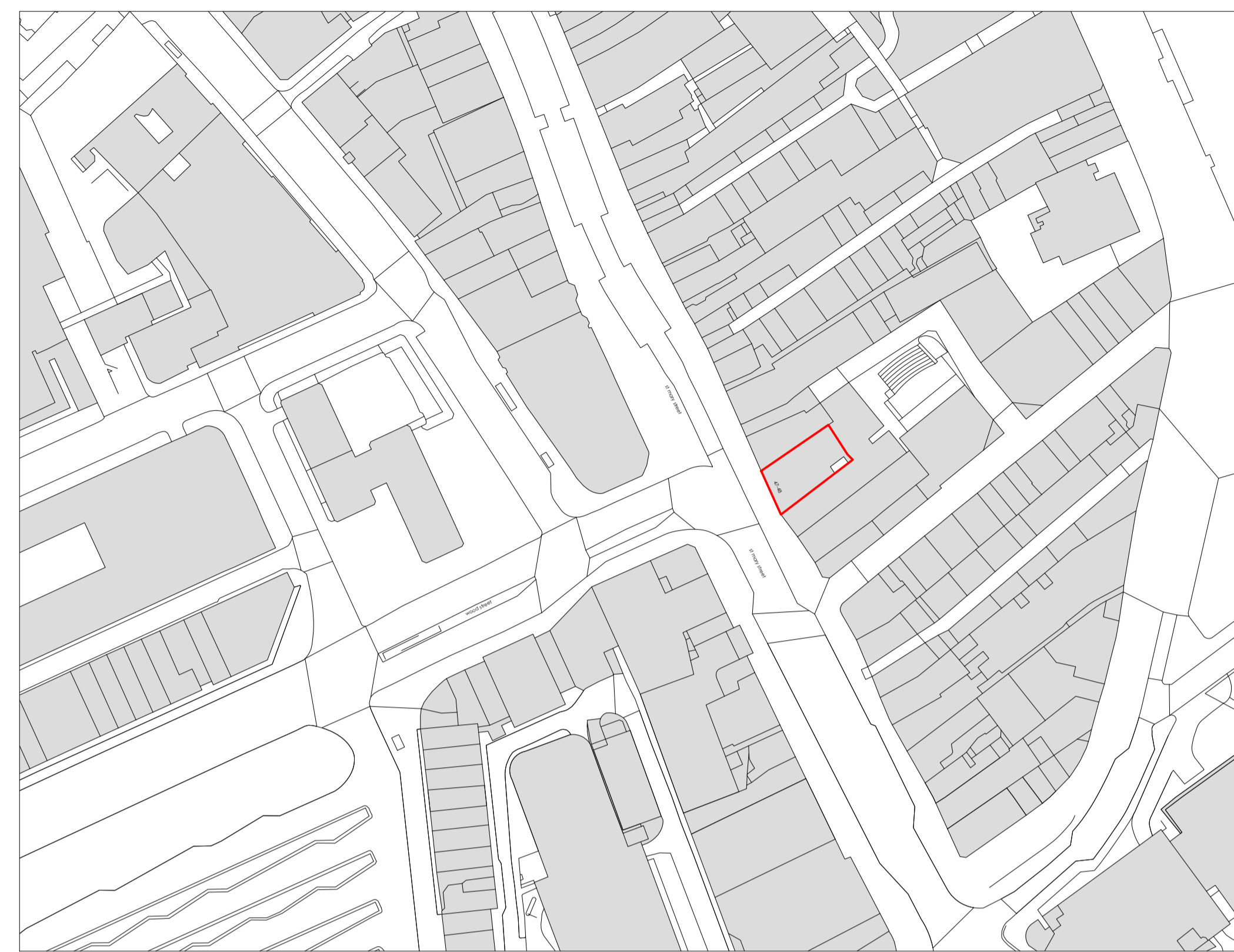
location plan scale | 1:1250