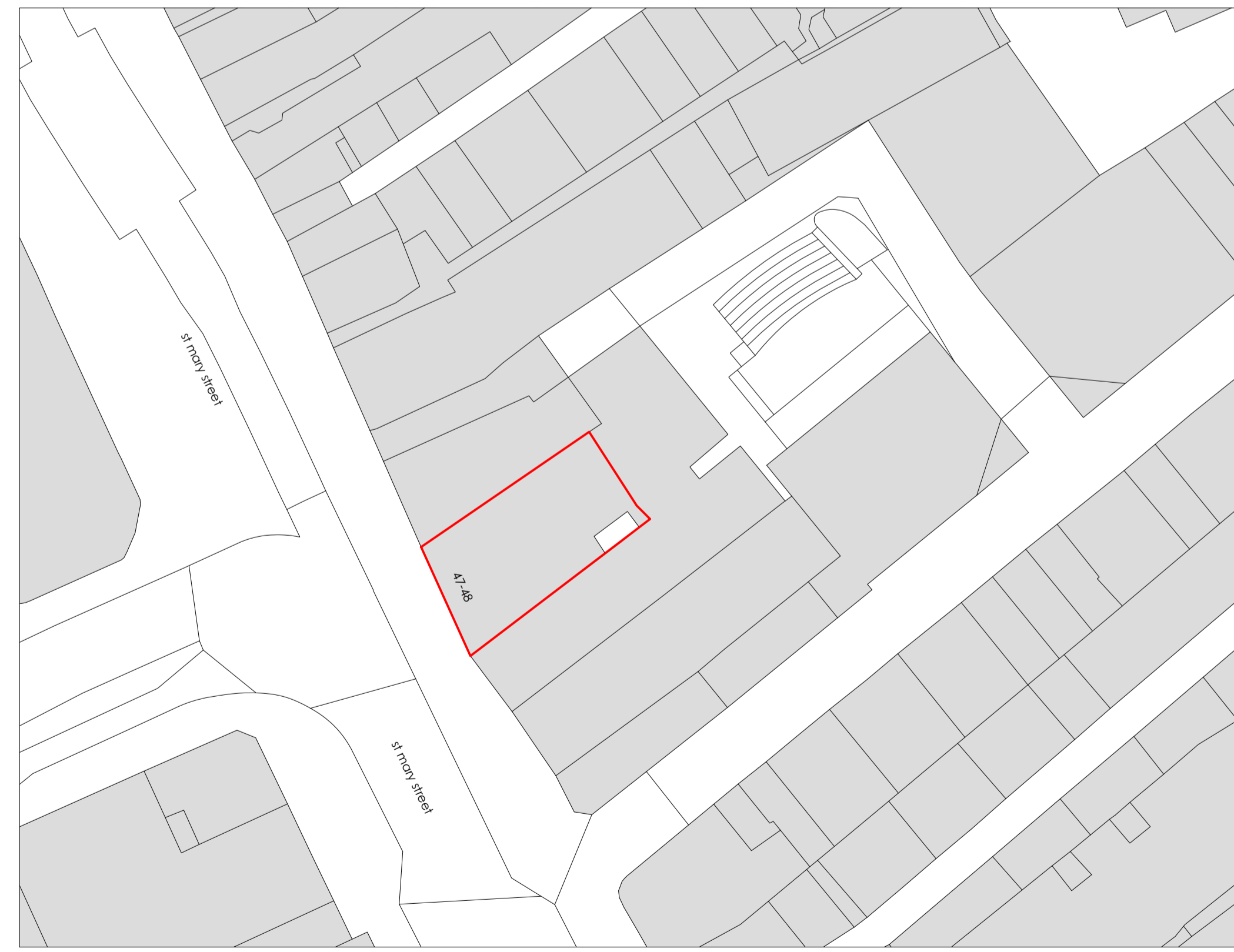
block plan scale | 1:500